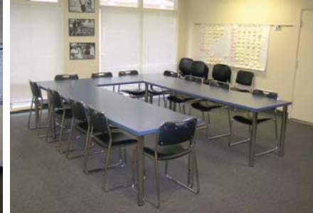
[Conference Room - CHS Administrative Offices]