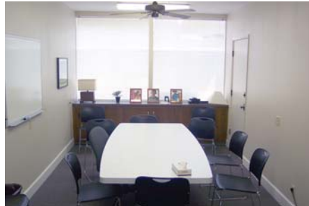
[Group Room/Classroom - CHS Counseling Clinic]