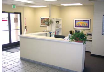
[Lobby - CHS Administrative Offices]