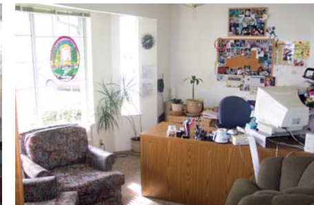
[Program Office - Hutton House]