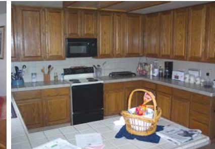
[Kitchen - Hutton House]