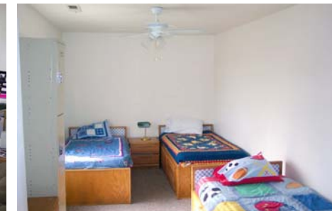
[Shelter Bedroom - Hutton House]