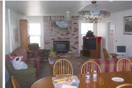
[Living Room/Common Area - Hutton House]