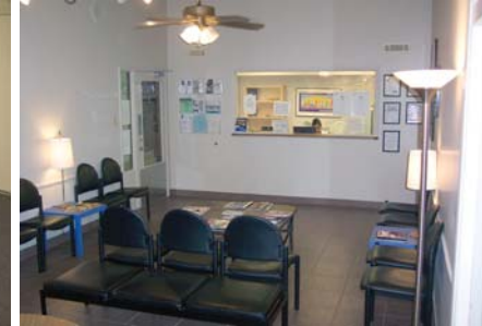
[Lobby - CHS Counseling Clinic]