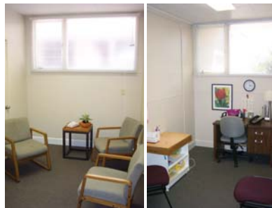
[Counseling Rooms - CHS Counseling Clinic]